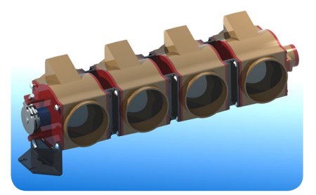
Over 300 parts were designed and constructed for this engine assembly. Cobalt's 3D modelling tools assisted where CAM software could not.