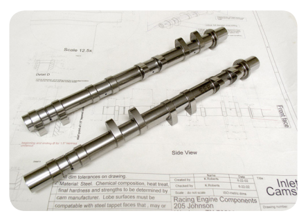
Roberts produces these 260HP inlet cam shafts, that are ground and super finished to specification.