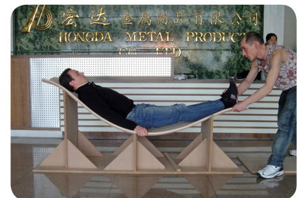
Testing the precision of the 3D design during prototyping.