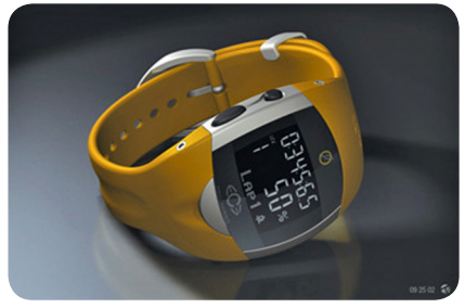
Photo-realistic 3D models have more power to sell design to upper management decision makers.