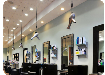
The Freestyle weightless blow drying system.

"I like how intuitive the drawing is. If you take something like AutoCAD and Solidworks and stuff like that, you kind of go through a lot more hoops than you do with Xenon. Mainly it's a very intuitive program to use."