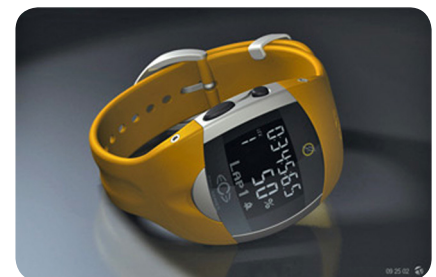
Photo-realistic 3D models have more power to sell design to upper management decision makers.